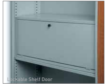
Lockable Shelf Door