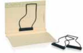
Plastic File Clip