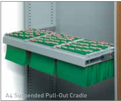
A4 Suspended Pull-Out Cradle