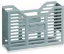
A4 Economy Plastic Container