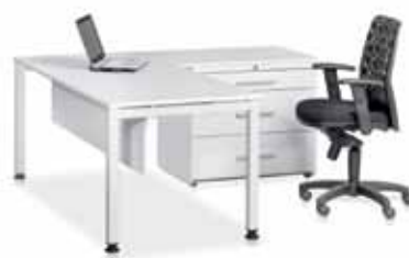
Mini Top Retrieval Cabinet 2 Drawer Stationary Drawer