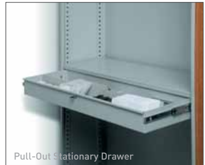
Pull-Out Stationary Drawer