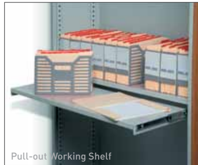
Pull-out Working Shelf