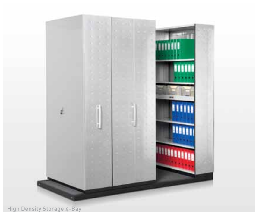
High Density Storage 4-Bay