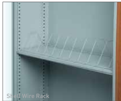
Shelf Wire Rack