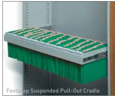
Footscap Suspended Pull-Out Cradle