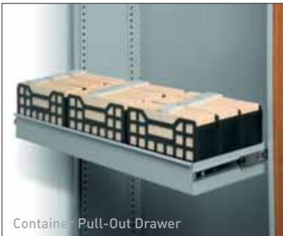
Container Pull-Out Drawer