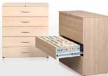
Top Retrieval Cabinet Central Locking System

A logical design coupled with innovation and superior quality results in an information storage system that is attractive, effective and economical.