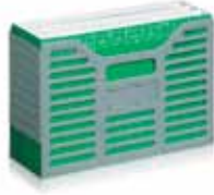
Master Box Container