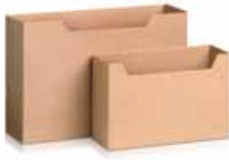
A4/A5 Board Containers