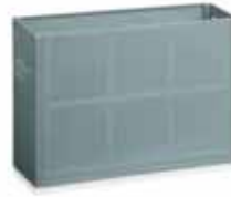
A4 Solid Plastic Container