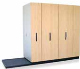
Laminate Cladding 6-Bay

High Density Storage represents a sophisticated combination of functional space-saving and flexibility.