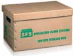
Off-Site Storage Box